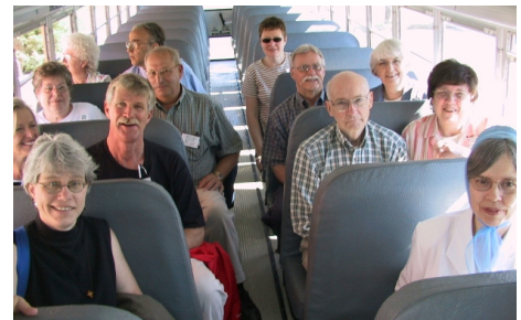
All aboard, reaching the same goal together.

11:30 A.M. - 12:00 P.M. – Open Session – Highlights of the Individual Workshops, Sending