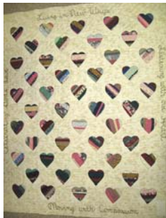
US "Share Your Heart Traveling Quilt

They have come from Germany, Indonesia, and Bolivia as well as other countries.